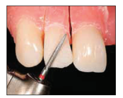
Fig. 8. A red-stripped, flame-shaped, fine diamond is used to establish outline form and facial planes.