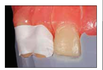
Fig. 3. Putty matrix with first increment of the 3-D characterized build-up showing lingual enamel increment. (Note that the preparation to the free gingival margin and removal of the incisal edge in this case was performed for teaching purposes only. Rarely would teeth need to be prepared this aggressively.)

demonstrate excellent strength and the ability to withstand functional stresses.<sup>22,23</sup> Microhybrids blend with the natural dentition to create an esthetic restoration, allowing the practitioner to mimic dentin and enamel morphology.<sup>22,23</sup>