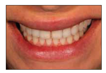
Fig. 15. Preoperative view showing the patient's diastema.