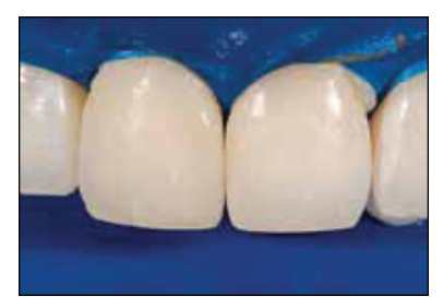
Fig. 17. Close-up view showing maverick coloring and polychromicity built into the restoration using the nanohybrid composite.