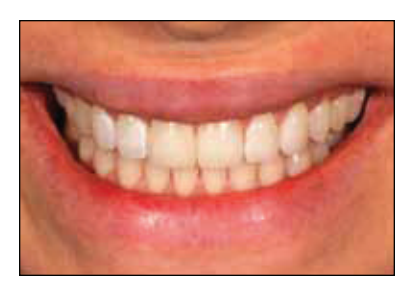
Fig. 18. View of the restorations the day after completion, showing an improved esthetic result.

a nanohybrid universal composite (Venus Diamond, Heraeus Kulzer, Inc.) was placed according to a 3-D characterization layering technique and the finishing and polishing protocol described in detail above was followed. The final restorations mirrored each other and the surrounding dentition enhanced the patient's smile (Fig. 18).