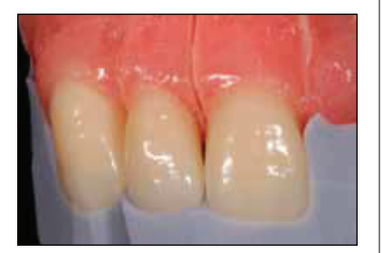
Fig. 2. Putty matrix trimmed to the facial incisal line angle, shown here on tooth No. 8 using a customized typodont.